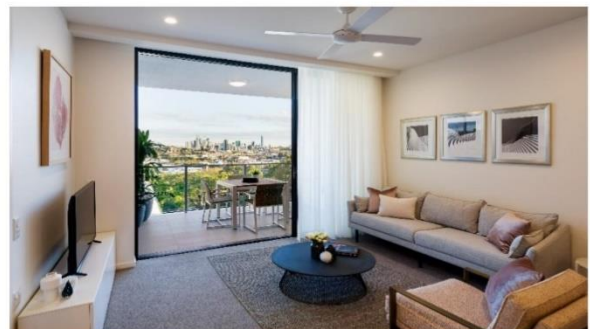
2 bed, 2 bath apartments from $439,000*

*Price correct at 23/08/18. Image is of apartment S403